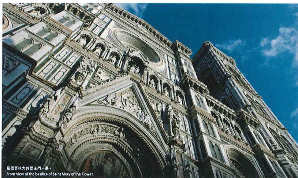
聖母百花大教堂正門一景。 Front view of the basilica of Saint Mary of the Flower.