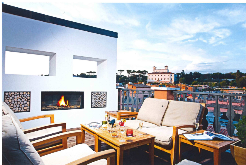
Sweeping views from the roof of Portrait Roma.

That is if you ever want to leave the hotel at all. My most unforgettable experience in this hotel is still the 360-degree view on the roof terrace, which will wrap around you like Rome's gentle embrace.