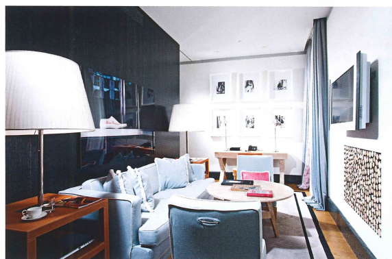
The Penthouse Suite is decorated in the Ferragamo style.

在酒店天台享用早餐时，最心旷神怡的是可在晨光中一览罗马市中心景色，偶尔还会有一些海鸥飞来凑热闹，希望可以与你共享早餐。闹市加海鸥，这看似不搭的景致，却如此融洽地出现在眼前。