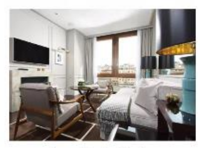
Above: A Prestige Suite River View. Left: Caffè dell'Oro has a view of the Ponte Vecchio (far left)

The signature breakfast here is smoked salmon with avocado cream and a poached egg on multigrain toast. At night, Caffé dell'Oro serves local specialities, including turbot rolled in black-ink bread and filled of heef with squash blossom followed by a classic Tuscan tiramisu. ROOMS AVAILABLE FROM £1,412.80 A NIGHT. TO READ OUR REVIEW AND FOR LATEST PRICING, VISIT REDONNINE COUK/PORTRAITERENZE