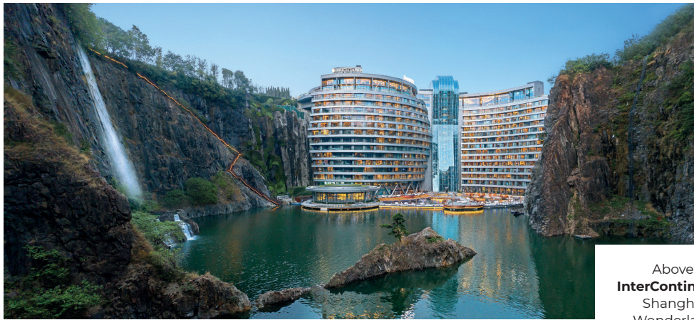
Above: InterContinental Shanghai Wonderland Below: rooftop views at London's Mondrian Shoreditch