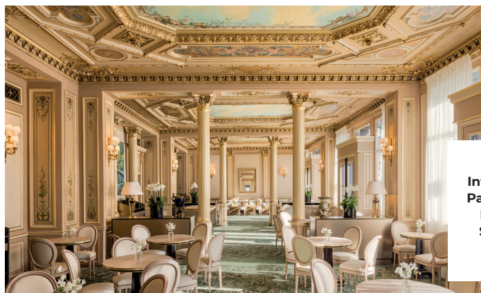
From left: InterContinental Paris ; New York's ModernHaus SoHo ; the ME Barcelona