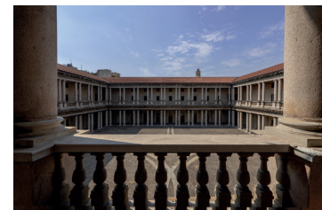
Above: The soon to open Portrait Milano Below: Tokyo's Edition Ginza

Of course, we can't talk fashion capitals without giving worship at the temple of cool that is New York . SoHo's always a favourite spot of Luxe Radar's, with its eclectic mix of designer shops, quirky boutiques, cobbled streets and cast iron-fronted buildings. We'll be heading for ModernHaus SoHo, a member of Preferred Hotels & Resorts, where its Bauhaus-inspired interior and incredible views make it a red hot destination. After a day's shopping, the delicious rooftop pool and bar are where you'll want to be, sipping cocktails and enjoying amazing views of the city that never sleeps. modernhaushotel.com ●